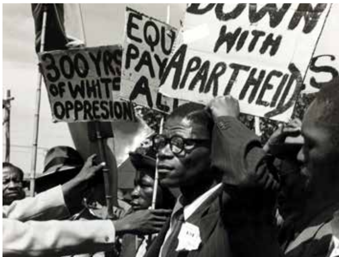
Nonviolent protests against apartheid (above) reached a turning point with the Sharpeville massacre (right) in 1960, in which 69 black South Africans were killed.

On March 21, 1960, a peaceful protest turned tragic when police killed 69 black South Africans, including 8 women and 10 children. These killings were the Sharpeville massacre, and it marked a turning point in the anti-apartheid struggle. In response to the police violence, riots broke out all over the country. The government retaliated with its heaviest crackdown to date by implementing martial law, banning the existence of the ANC, and arresting many of the ANC's members. Mandela, Sisulu, and others were forced to go into hiding, which caused them to change their tactics and found the Umkhonto we Sizwe (Spear of the Nation), a militaristic, guerrilla faction of the ANC. Though reluctant to abandon their nonviolent philosophy, Mandela and other ANC leaders felt they had no choice.