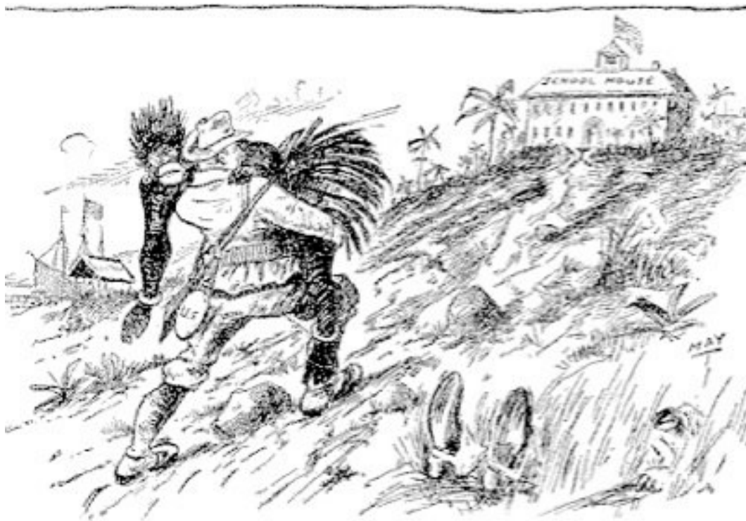
THE WHITE MAN'S BURDEN.— The Journal, Detroit.

Group Discussion: What could this picture mean if it relates to imperialism and religion/education?