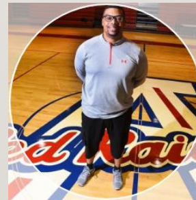
Mr. Pitt Athletic Director