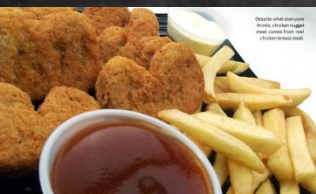
Chicken nuggets, anyone? How chicken nuggets are made

Chicken nuggets are made in a food processing factory from real chickens. The nugget-making process starts in the deboning area. Once the skin and bones are removed, the chicken meat is sliced and diced. The tender breast meat is cut into big chunks and placed into a large bin. In the bin, seasoning is added and blended with the meat. Chicken skin is also added to the mixture which acts like glue that binds the meat together. After the grinding stage, the meat is added to a machine to form the nuggets. McDonald's nuggets are made into four different shapes: a ball, a ball, a boat and a bowtie. First, a light coat of batter is added and another thicker layer of batter is added called tempura. After they are battered, they are bagged, boxed and prepared for shipping. Nuggets are kept frozen until cooking. When the nuggets arrive at the restaurant, the meat inside is still raw. Once the nuggets are placed into the deep fryer, the meat is fully cooked and ready to be eaten.