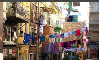
Laundry around the world Clothes get cleaned in many different ways

2013 was tagged The Year of the Selfie. A selfie is a photograph taken at arm's length with a digital device held by a person in the selfie. Selfies have become increasingly popular since the emergence of smart phones that include built-in cameras and social media sites like Facebook and Instagram that upload to the internet within seconds. Here are a few tips for taking fabulous selfies. Select the best angle, and be aware of the surroundings. Also, use the crop and zoom tools on the phone to cut out irritating photo-bombers, and play with the filters. 36% of people have admitted to enhancing their selfies with filters. People take selfies for a multitude of reasons. The top five reasons are: to remember a joyful moment, to capture a humorous moment, to show off a nice outfit, to capture a good hair day or simply because they are feeling confident. Not everyone likes to take selfies, and that's OK. Selfies are a form of self-love. They say, "I like who I am, and I want to share myself with the world."