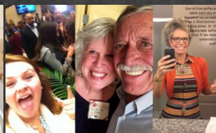
The art of the selfie The phenomenon of self-photography

Video games are one of the most popular "toys" for kids. But, are they good or bad? Some brain researchers believe there are positive effects of playing video games. Video games give the brain, and the cell connections in it, a real workout. There are many positive effects of playing video games, including increased problem-solving and logic. For example, when kids play Angry Birds , it trains the brain to come up with creative ways to solve problems quickly. Other positive benefits are quick reflexes, perseverance, memory and concentration. However, some scientists believe there are negative effects of playing video games. Violence is the number one negative effect because many children are exposed to violent images through violent video games. Other negative effects can be not wanting to play with friends, obesity, poor performance in school and although video games are better than TV, they can be good and bad.