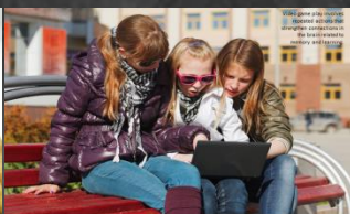
The vortex of video games The positive and negative effects

Chicken nuggets are made in a food processing factory from real chickens. The nugget-making process starts in the deboning area. Once the skin and bones are removed, the chicken meat is sliced and diced. The tender breast meat is cut into big chunks and placed into a large bin. In the bin, seasoning is added and blended with the meat. Chicken skin is also added to the mixture which acts like glue that binds the meat together. After the grinding stage, the meat is added to a machine to form the nuggets. McDonald's nuggets are made into four different shapes: a ball, a ball, a boat and a bowtie. First, a light coat of batter is added and another thicker layer of batter is added called tempura. After they are battered, they are bagged, boxed and prepared for shipping. Nuggets are kept frozen until cooking. When the nuggets arrive at the restaurant, the meat inside is still raw. Once the nuggets are placed into the deep fryer, the meat is fully cooked and ready to be eaten.