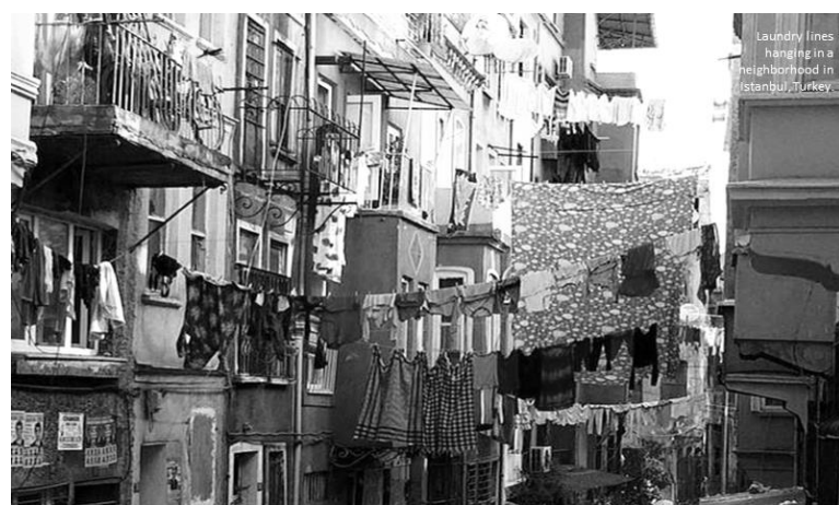
Laundry lines hanging in a neighborhood in Istanbul, Turkey