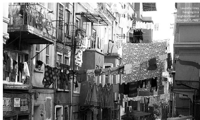
Laundry lines hanging in a neighborhood in Istanbul, Turkey