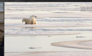
Polar bear predicament As the ice melts, so does the polar bear population

Everyone wears clothes, but some people wear a few clothes and some people wear a lot of clothes. Some clothes are for playing around and working. And, some clothes are fancy for more formal occasions. Everyone wears some form of clothing, but everyone gets their clothes clean in very different ways depending on their living conditions. Just because people live in the same country doesn't mean they all clean their clothes the same way. Some people have washing machines in their home. Some people take their clothes to the cleaners and pay someone else to wash their clothes. Some people wash their clothes in a pan or tub of water while others wash their clothes in a stream or lake. Since water is needed to get clothes clean, they must get dry. Some people use a large dryer and some people hang their clothes on a line and let the clothes dry naturally. There is no right or wrong way to clean clothes. Everyone has laundry but everyone has a different system for getting them clean.