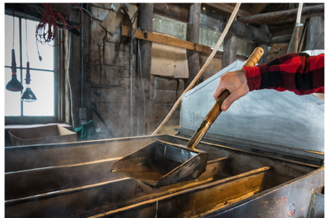
Worker checking maple syrup in evaporator

Once the sap has been collected, it gets filtered to remove any dirt. Now, it's ready to be turned into syrup. It takes forty gallons of sap to make one gallon of maple syrup. Why? Sap is mostly water. It has very little sugar in it. To get a thick, sweet syrup, the water must be boiled off. A piece of equipment called an evaporator heats the sap. Water evaporates as steam. The sap gets thicker and sweeter until it becomes maple syrup.