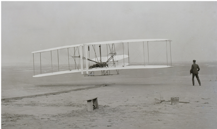
First engine powered flight - 120 feet in 12 seconds

Before inventing the airplane, the Wright brothers designed 3 gliders of their own. Gliders do not have engines. When they designed their airplane, they added an engine. On December 17, 1903, the Wright brothers flew the first airplane in Kitty Hawk, North Carolina.