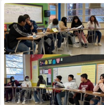
Swann Middle students ready to express their arguments in their EL debate.