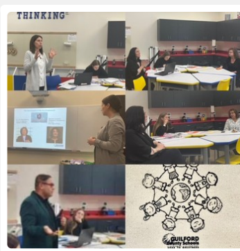
EL coordinators presenting an overview of our 3Ls framework at High Point University .