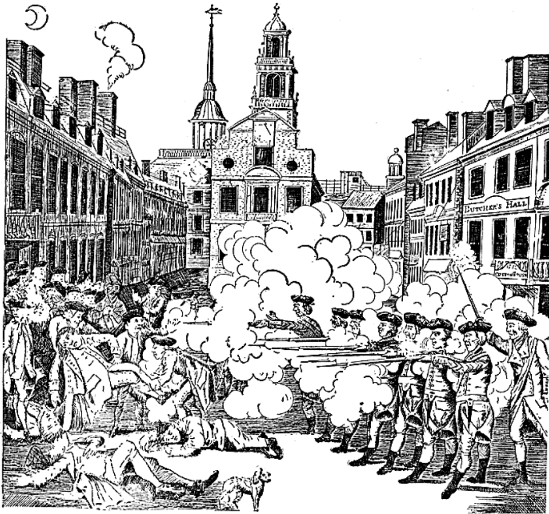
The Bloody Massacre - Paul Revere