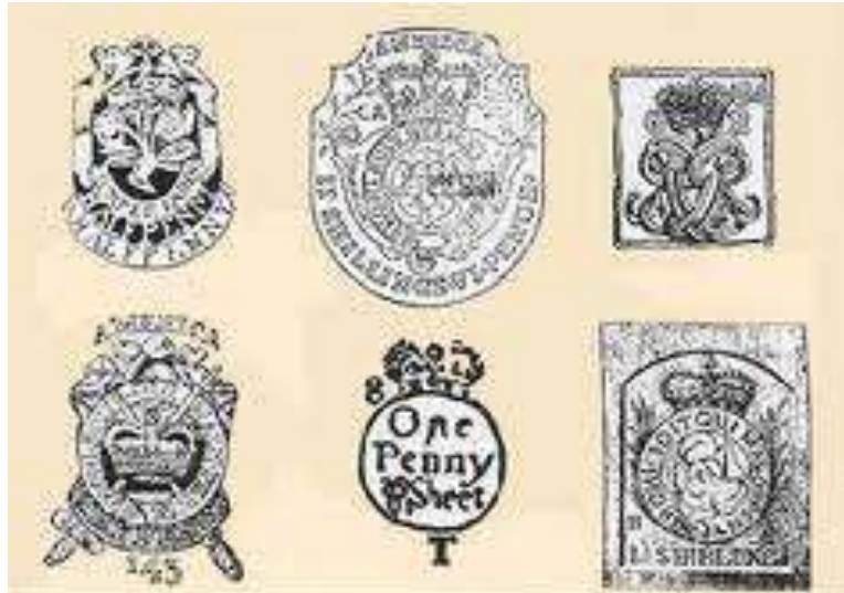
Stamps affixed to paper products under the Stamp Act.

1. What kinds of products were taxed under this act? (1 pt)