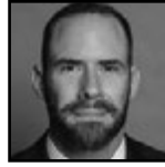
District 3 Pat Tillman